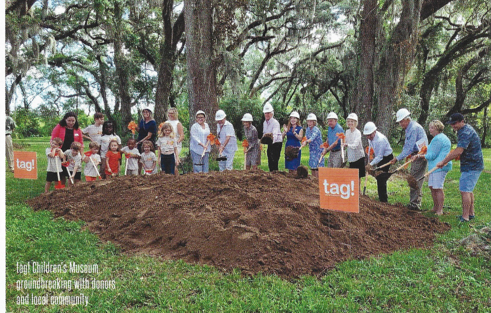
tag! Children's Museum groundbreaking with donors and local community

Phase 1 will include a playful collection of indoor and outdoor spaces including the Lastinger Big Backyard, the Florida Blue Healthy Gardens, The Cofrin Family Tree Story Garden, and The PLAYERS Championship STEM programming. Phase 2 includes additional