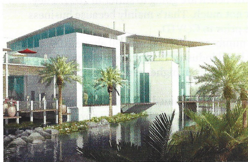
Tag! Children's Museum in St. Augustine